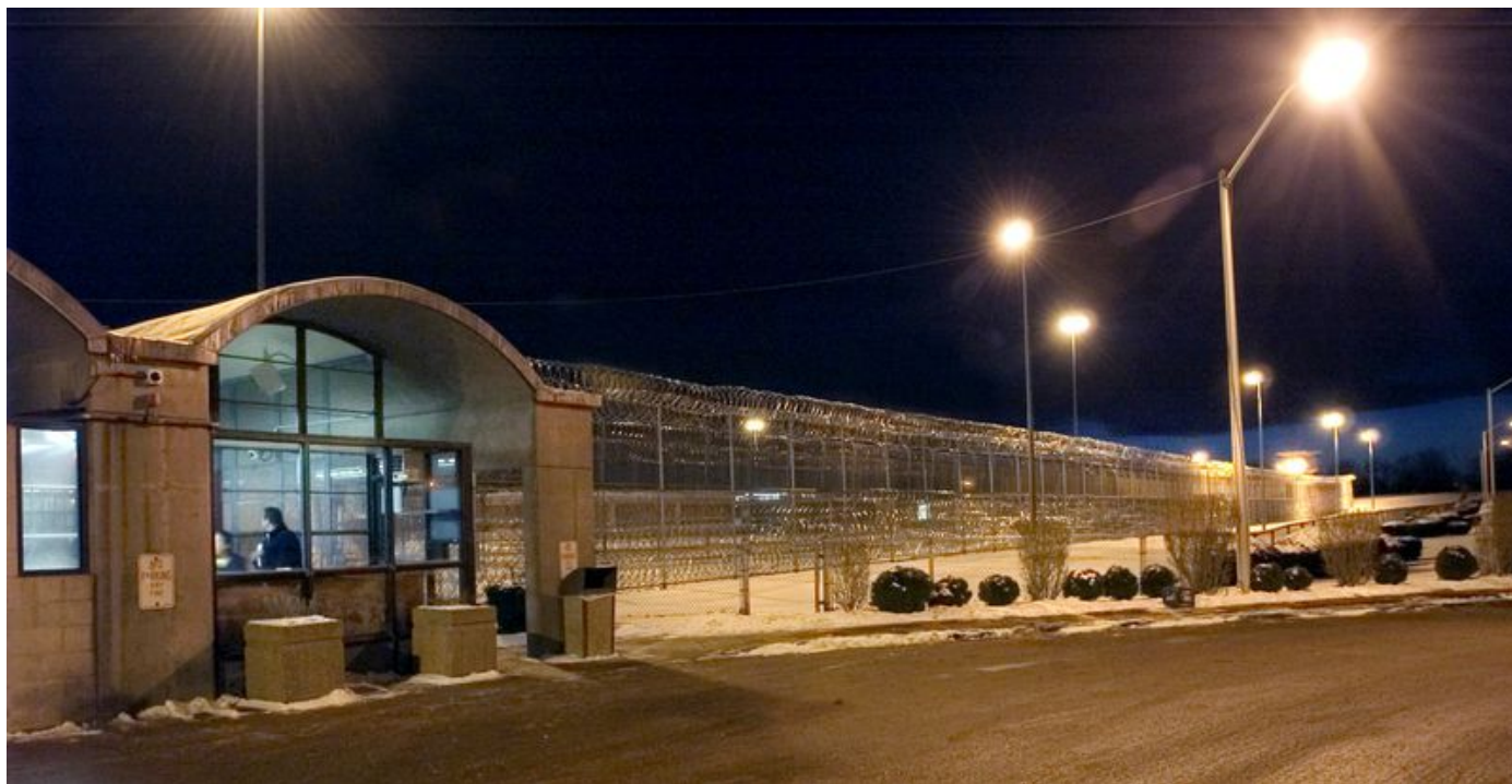
Osborn Correctional Institution in Somers.

By SCOT X. ESDAILE SPECIAL TO HARTFORD COURANT | MAR 06, 2020